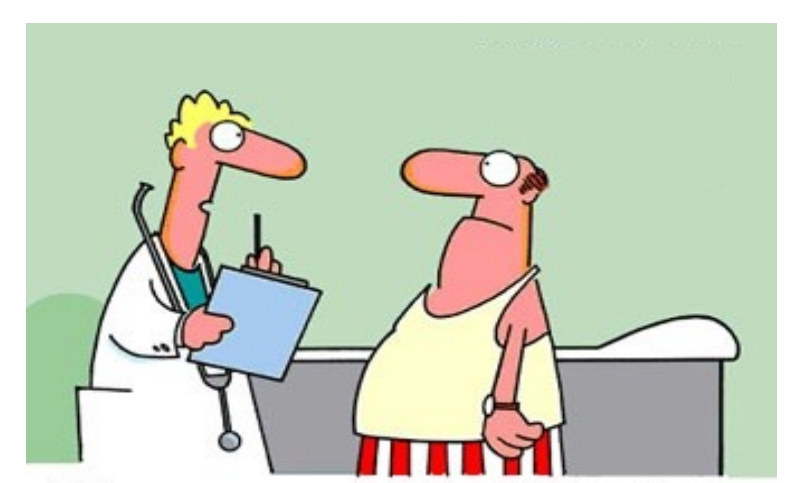
"Have you ever considered Gatorade as a substitute for pickle juice, Mr. Gristle?"

It's also said that professional athletes used to drink pickle juice before sports drinks like Gatorade were invented.