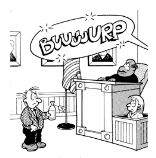
IN THE CASE OF SCHWEPPES VS. CANADA DRY, ANOTHER JUROR HAS TO BE EXCUSED...

If you're fed up of drinking plain water, you could always opt for a glass of flat ginger ale, since it helps to soothe your stomach.