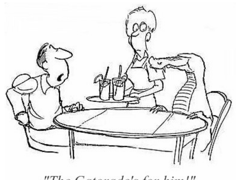
"The Gatorade's for him!"

Dehydration is the major side effect of alcohol intake. This causes some of the most common symptoms associated with hangovers - like headache, dizziness and lightheadedness. The quickest, easiest <u>and cheapest</u> way to relieve these symptoms, is to drink lots and lots of water.